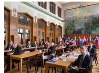
Participants Gazing into the Video Presentation of SMR

Website of the Embassy of Japan in the Czech Republic (Reference): https://www.cz.emb-japan.go.jp/cz/info_ambassador_activity.html